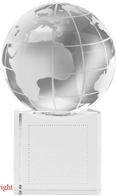
4. BASE RIGHT