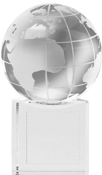
2. BASE BACK