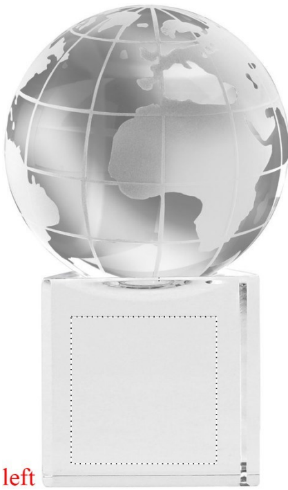
5. BASE LEFT